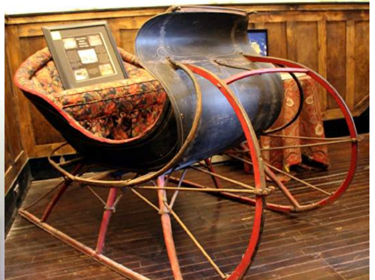
Above - Sleigh at Starr Clark Tin Shop