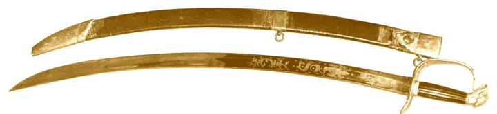
War of 1812 era sword with leather scabbard.