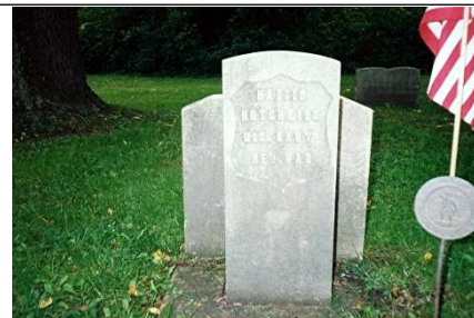
Harris Hotchkiss— Revolutionary War—Navy